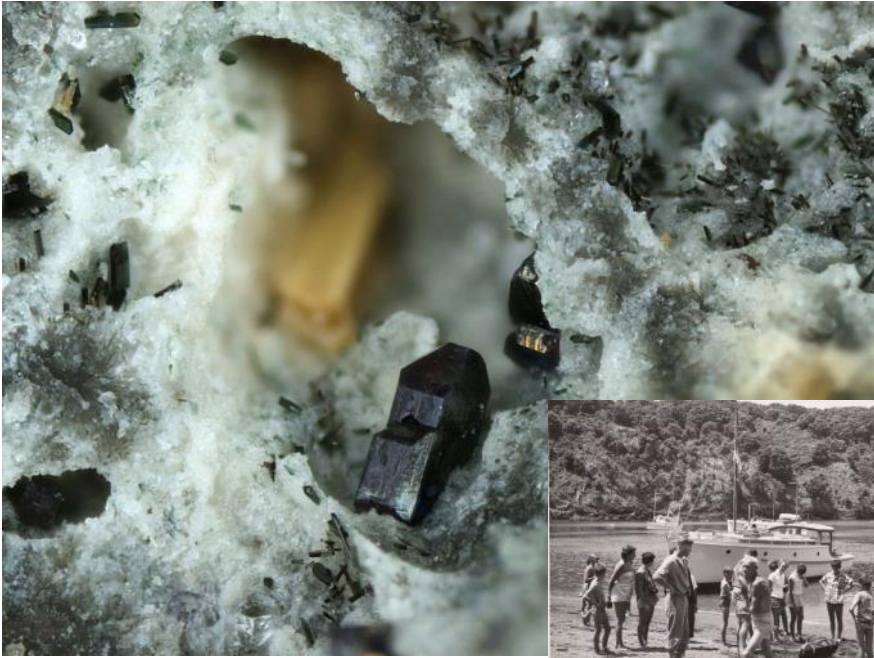
Historic Picture: Opo Bay, Mayor Island