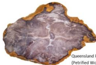
Queensland Pentoxylon (Petrified Wood)