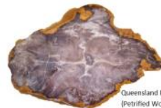
Queensland Pentoxylon (Petrified Wood)